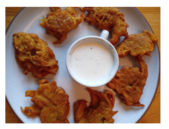
Shared meals, and shared stories are part of the Settlement Committee experience