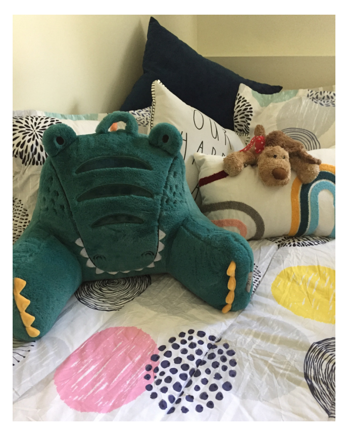
A bedroom ready for its new young occupant

Yukon Cares had the privilege of welcoming a second family to Whitehorse in late September. After spending nine years as refugees, unable to return home and unable to start a new life apart from being refugees, this family arrived to our small, welcoming northern city. The 36 hours of travel did nothing to dampen their excitement of beginning new lives in Canada. There have been many firsts: snow, school, English lessons, dentist, peanut butter and jelly, heating systems, skating, Hallowe'en, and mitts and toques. They often express wonder at the vastness and beauty of the land, finding it difficult to imagine a place with so few cities. The family looks forward to securing a driving license, and employment as they discover a new life journey in Whitehorse. Yukon Cares is grateful for the many donations and genuine care and support the family has received from the larger community.